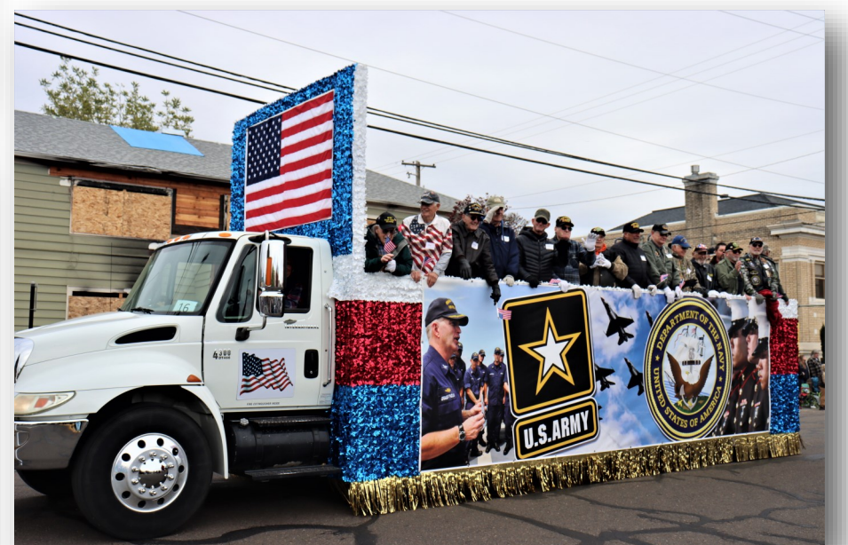
Veterans rode on a truck provided by Burcham's Metals