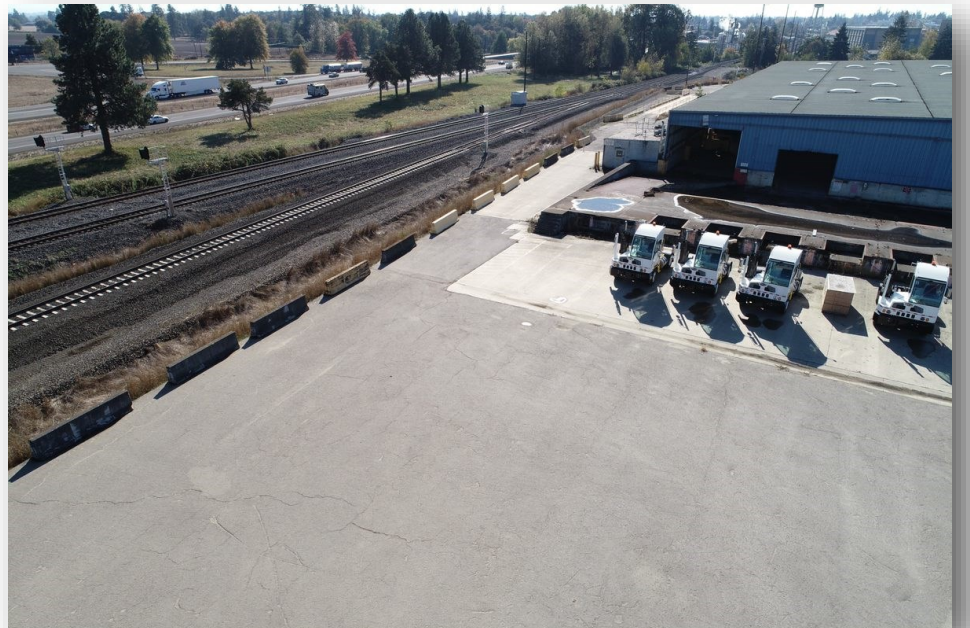
Reloading and transporting shipping containers at the new Mid-Willamette Valley Intermodal Center in Millersburg is expected to start by the end of the year.