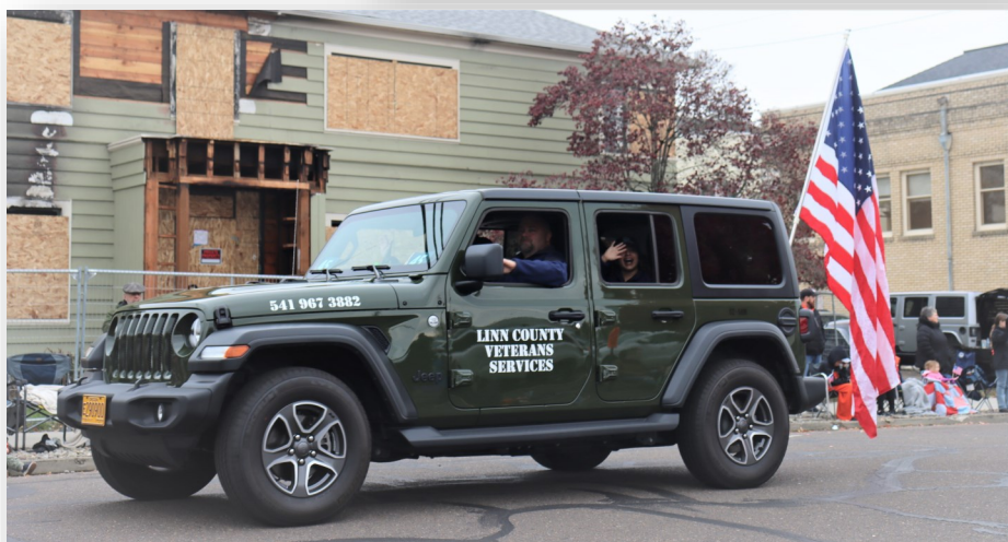
Our good folks from Linn County Veterans Services.