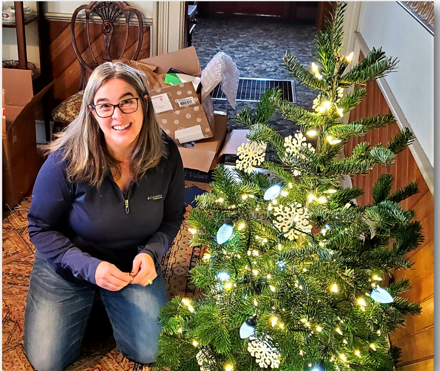
A variety of decorated Christmas trees will be available to bid on during the annual Festival of Trees in Brownsville. A portion of the proceeds benefit the Moyer House.