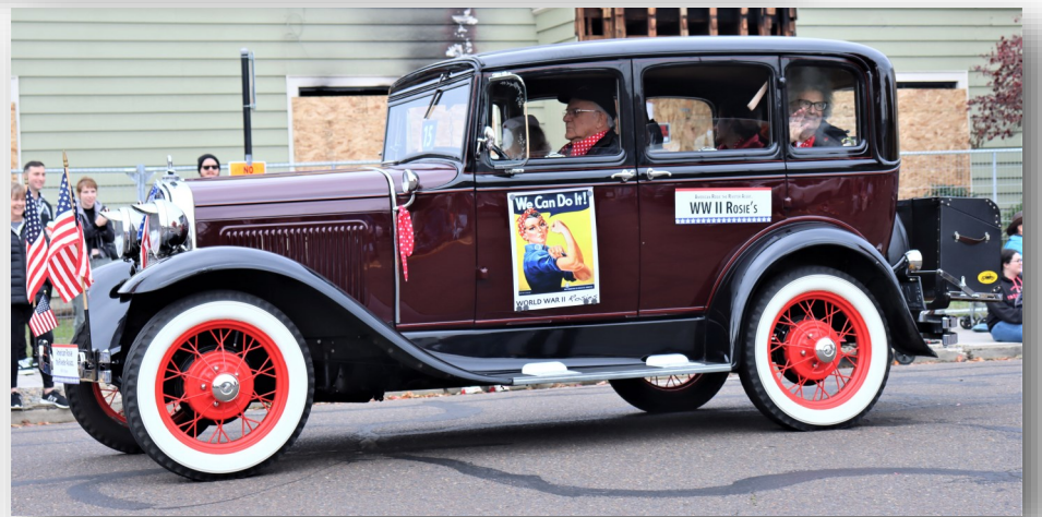
Rosie the Riveters helped win World War II.