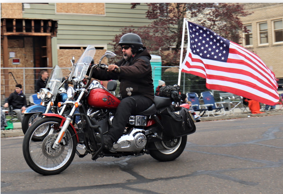
Hundreds of motorcycles provided lots of excitement.