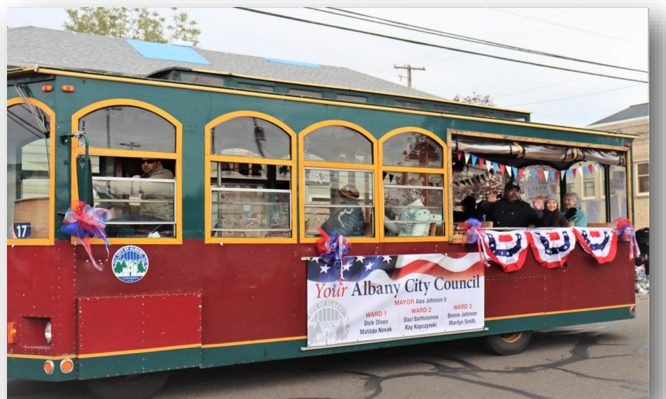
Members of the Albany City Council