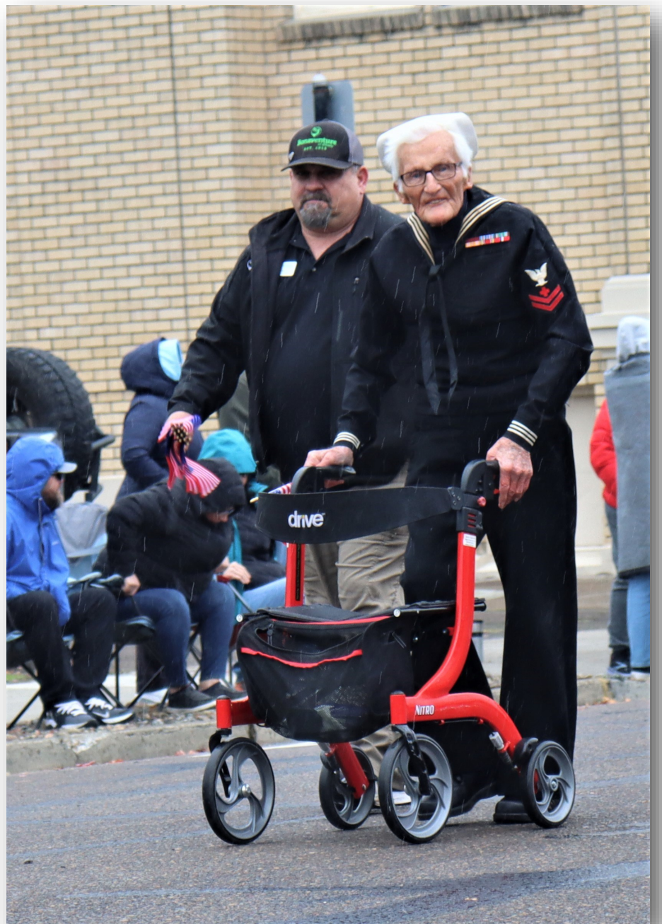
This 97-year-old veteran still looking handsome in his Navy uniform.