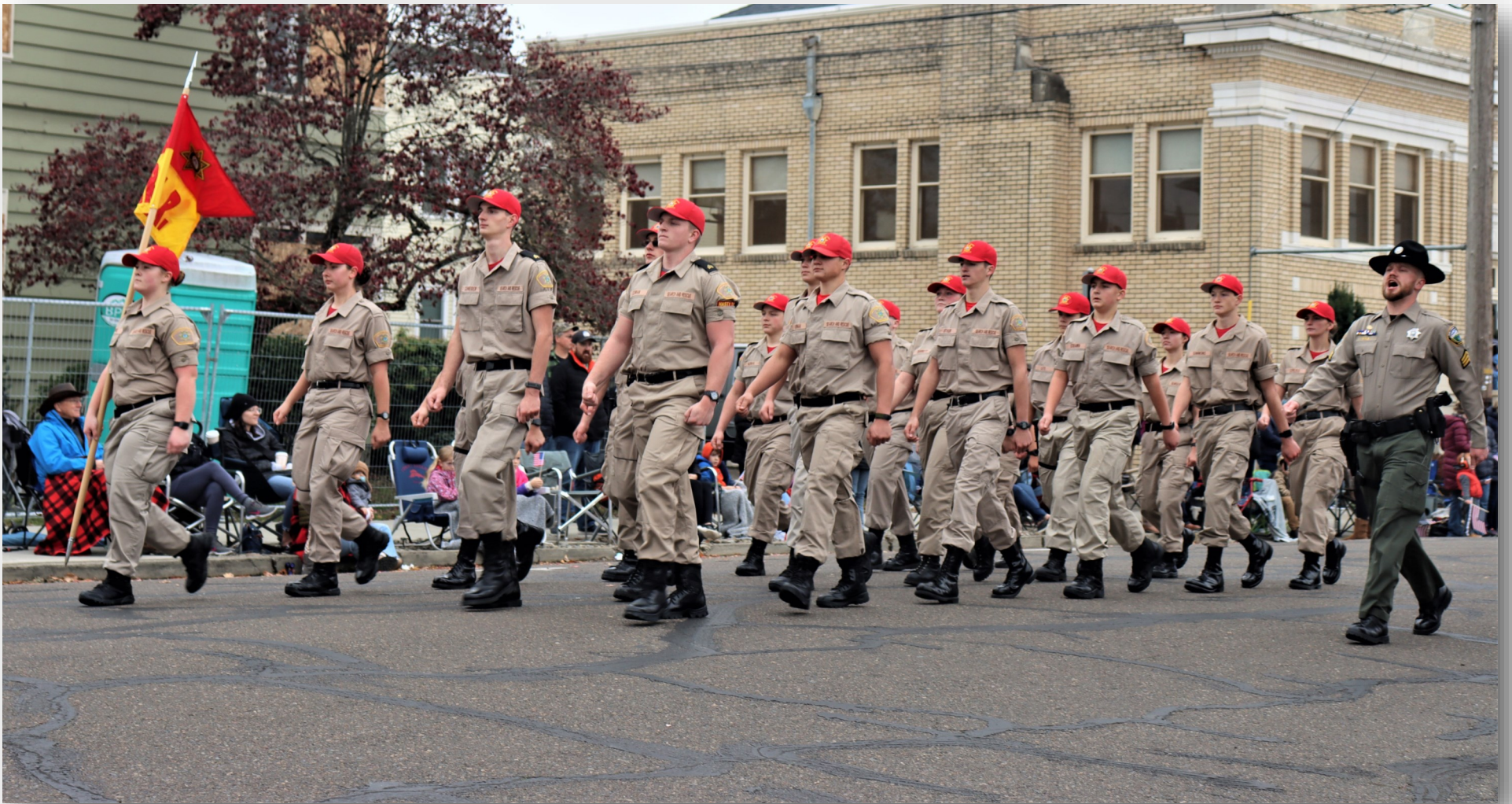
Members of the Linn County Sheriff's Office Search and Rescue march in the Veterans Day Parade.