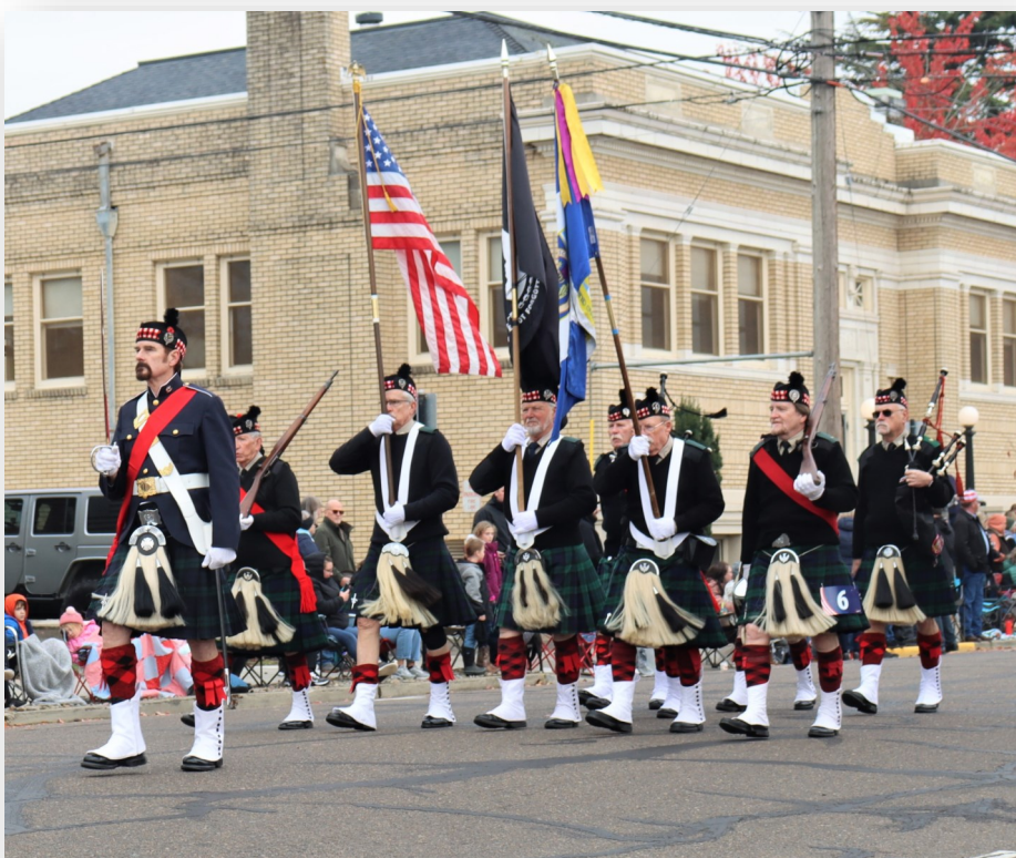
Willamette Valley Pipes and Drums